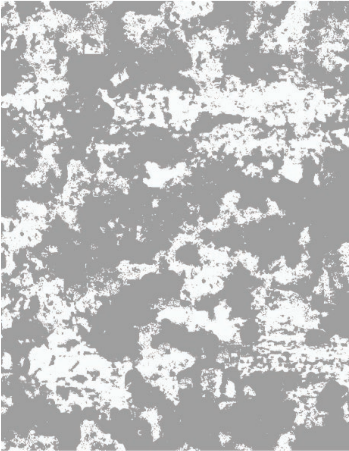
Full pattern rendering shown as 9x12' rug