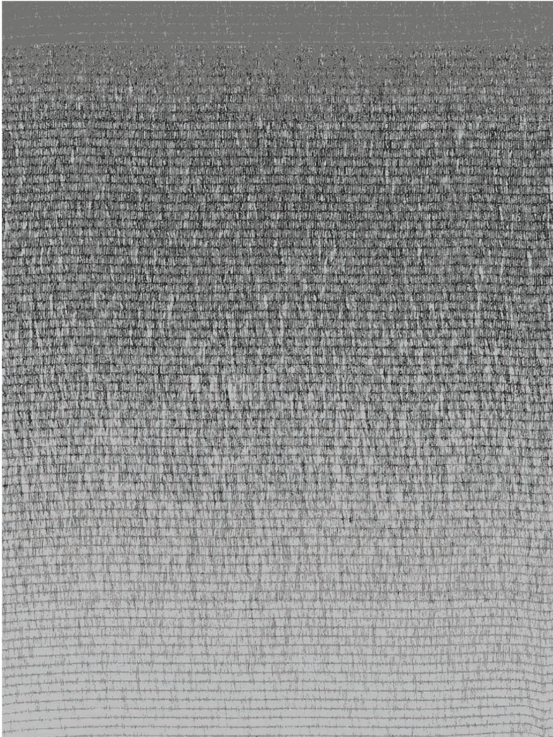
Full pattern rendering shown as 9x12' rug