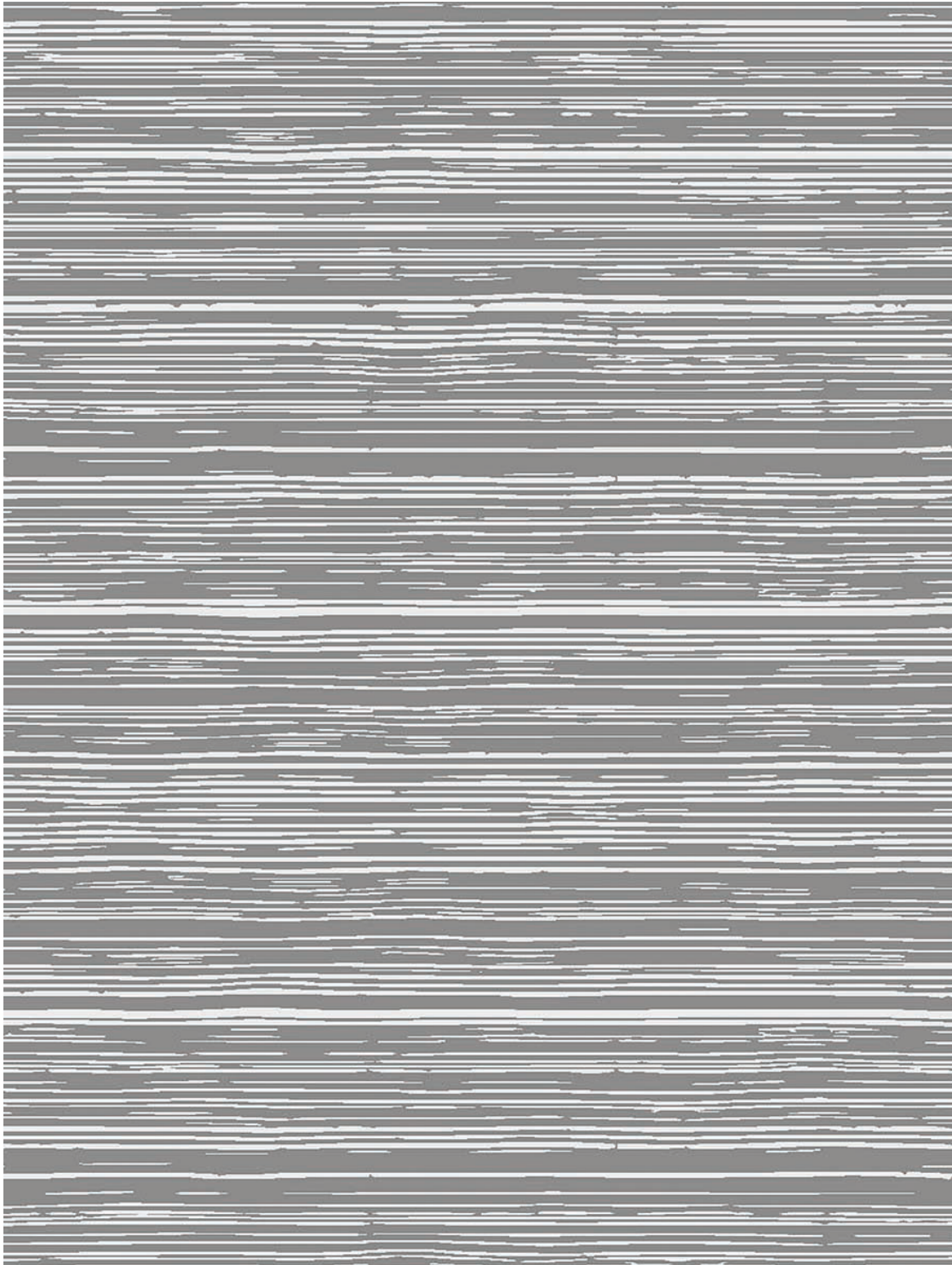
Full pattern rendering shown as 9x12' rug