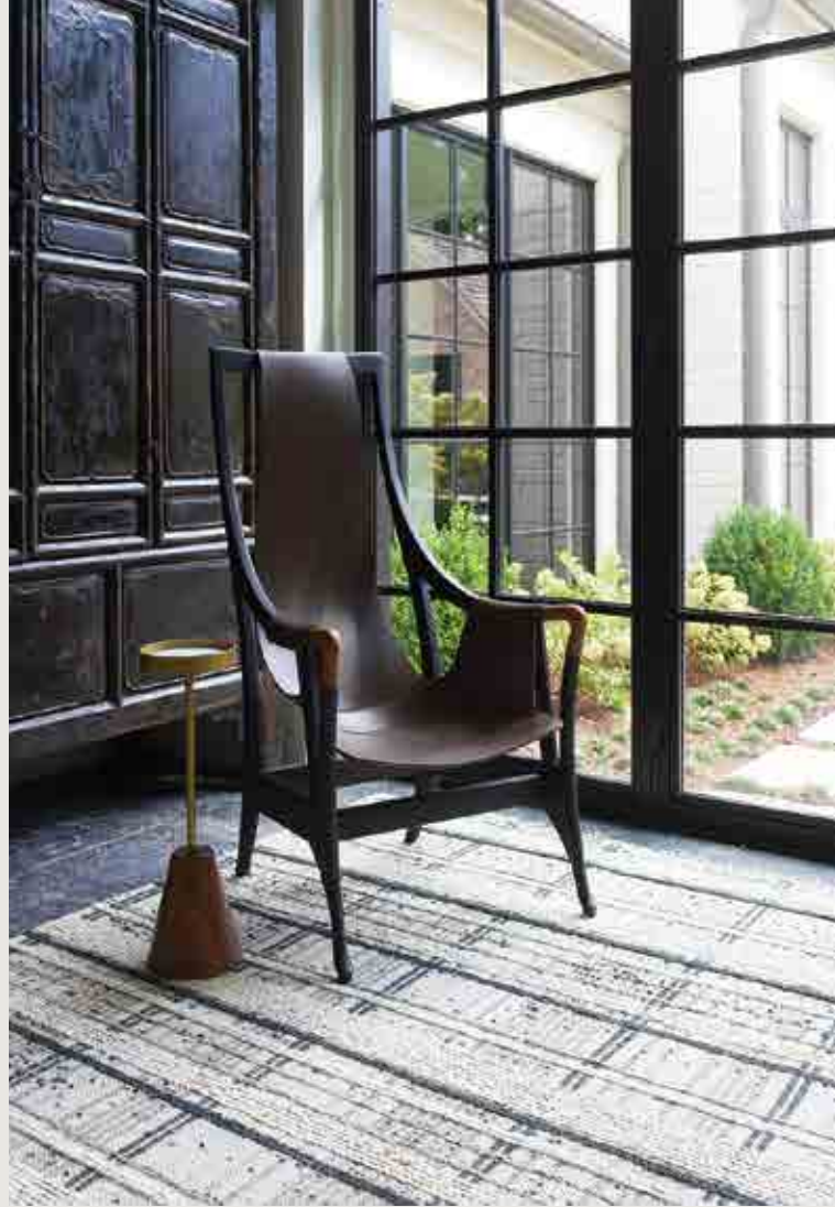
For a home designed to reflect its owners' world travels, a worldly selection of SHIIR rugs. With colors that range from neutral to saturated and texture galore, they anchor each room with unique personality.